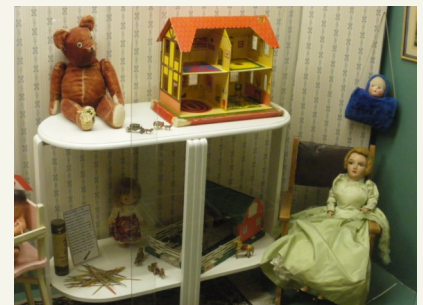
One of the display cases in the Young at Heart exhibit

Toys, toys and more toys! We are currently displaying 'Young at Heart' featuring toys from days gone by in the Tait Room. The display includes dolls, board games, 50 year old model airplanes and much more! Come discover how kids have kept entertained throughout the years and maybe stir up a few memories.